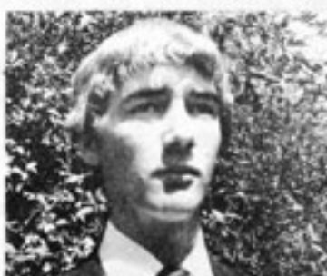
POLONIUS - D. Morris