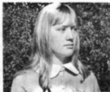
OPHELIA - D. Humphreys